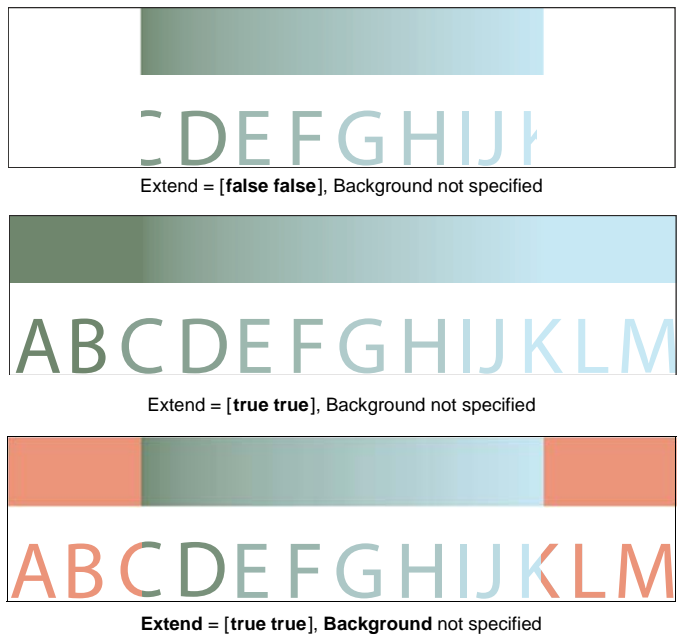
Figure L.10 – Axial shading (8.7.4.5.3, "Type 2 (Axial) Shadings")